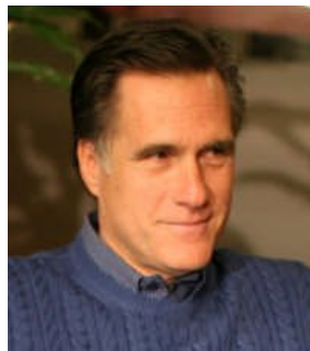
Governor Mitt Romney

raise taxes and he streamlined government programs and enacted economic reforms to stimulate growth in Massachusetts. This effort resulted in closing a $3 billion budget shortfall and moved the state from deficits to surpluses and helped the state add approximately 60,000 jobs in the last two years.